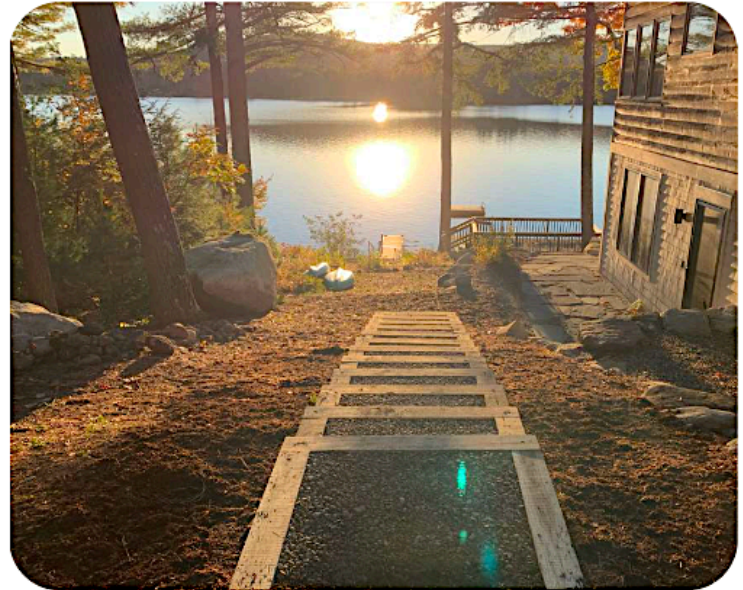
Newly installed infiltration steps, October 2024

With $112,550 in federal funding from Clean Water Act (Section 319), we were able to successfully complete another phase of watershed restoration work.