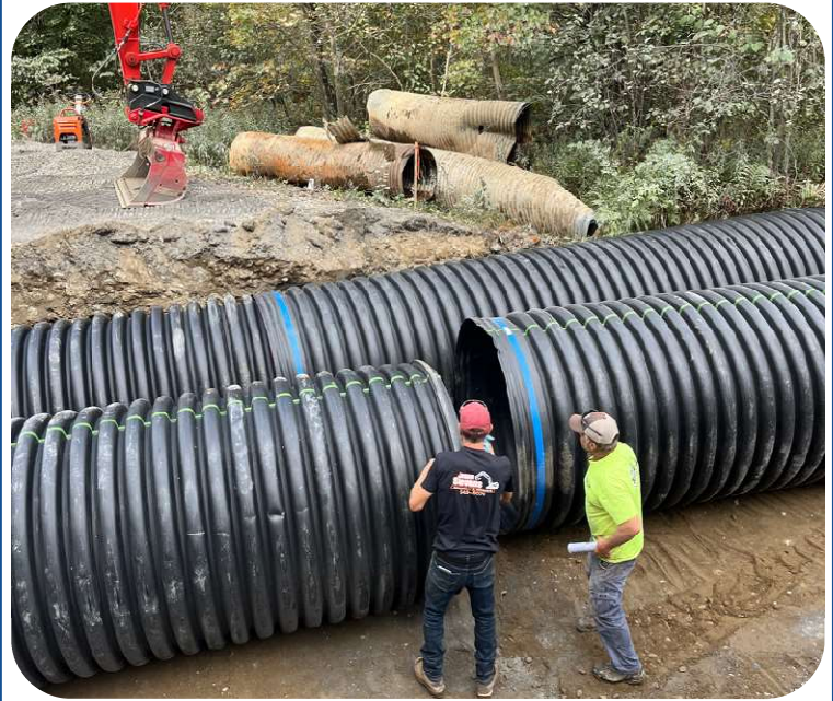
Local contractors install 2 FIVE FOOT culverts at the Cottle Hill Stream crossing by Locks Corner

This phase included 12 gravel road and driveway improvement projects, totaling $235,845 in grant and local funds to improve watershed infrastructure.